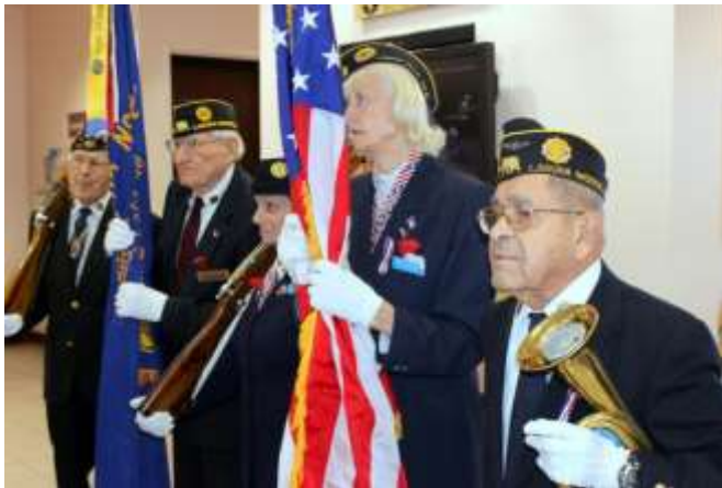
Post Honor Guard