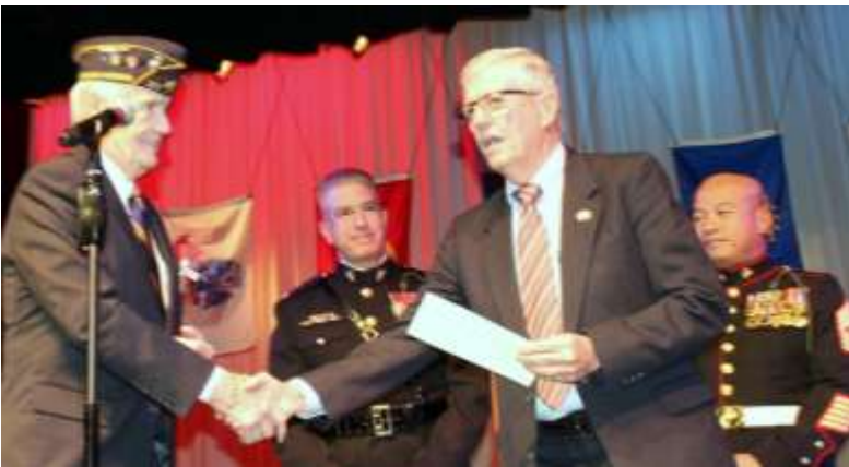
Post donates $1000 to 5 th Marines Thanksgiving Dinner