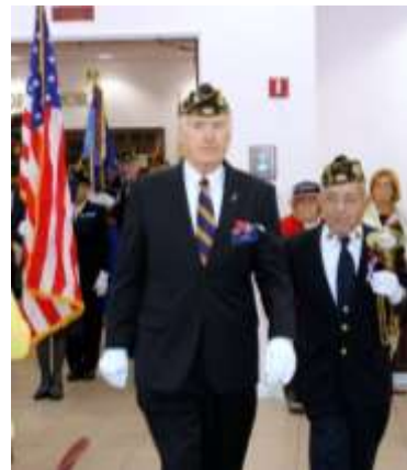
Cdr leading Post Honor Guard