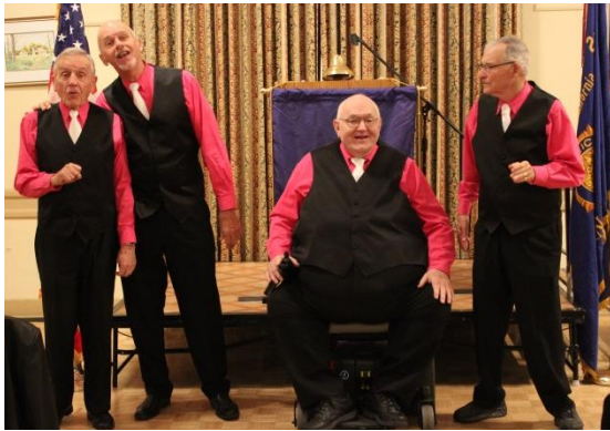
Sound Elements our January 2015 Entertainment