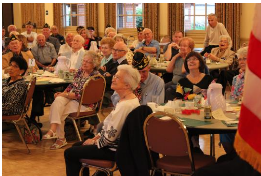
1 ST VICE COMMANDER

A special thanks to the Orange County Cribbage Club for their generous donation of cards and boards to be delivered to the Veterans at Long Beach Veterans' Hospital and to Operation Interdependence for our troops overseas.